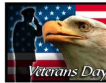
Veterans Village of San Diego is a 501(3)(c) corporation.

Proceeds will benefit Veterans Village and education for underprivileged Thai children thru Toys for Thailand.