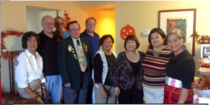
At the hospitality room- the pancit, lumpia, chips & salsa left little room for the dinner.. Food was delicious. Thank you.