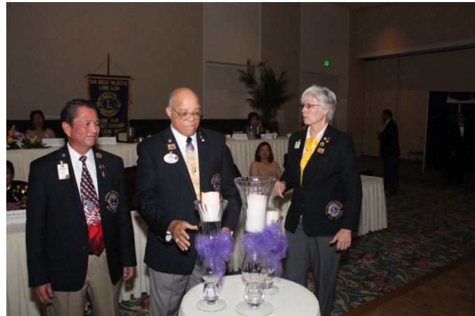
As you join the Lions you will become one of the Beacons of Hope that will light the world for the needy and the oppressed.