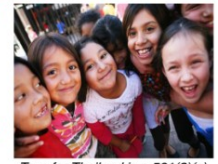
Toys for Thailand is a 501(3)(c) corporation.

Proceeds will benefit Veterans Village and education for underprivileged Thai children thru Toys for Thailand.