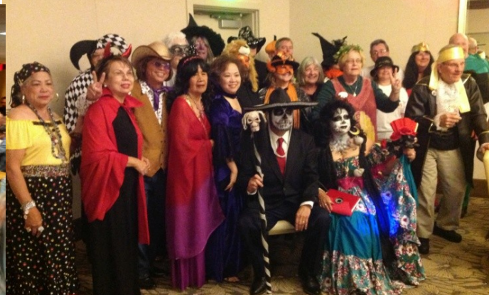
Even Governors are enjoying the Halloween Trick or Treat just like other kids in the block. A night to remember ...